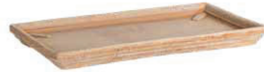
INFO PAG: 149