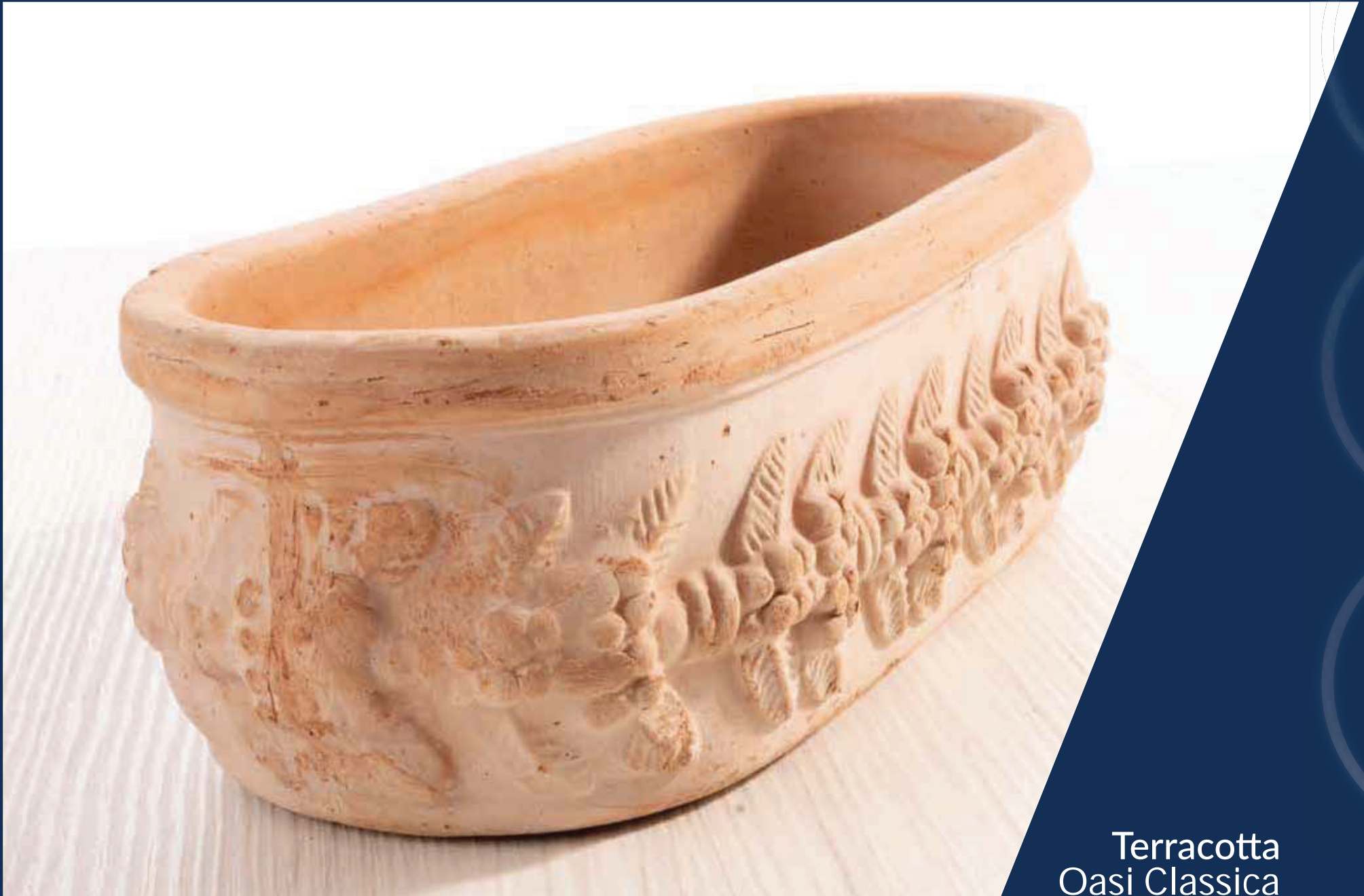
Terracotta Oasi Classica