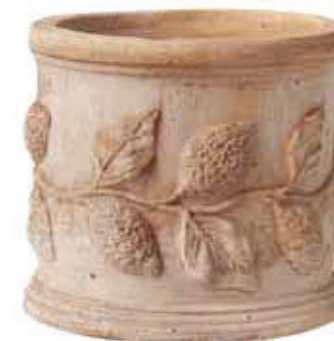
INFO PAG: 147