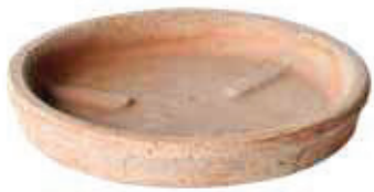
INFO PAG: 147