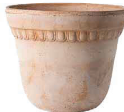
INFO PAG: 146