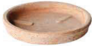
INFO PAG: 149