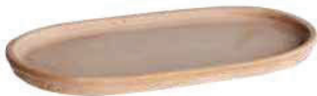
INFO PAG: 147