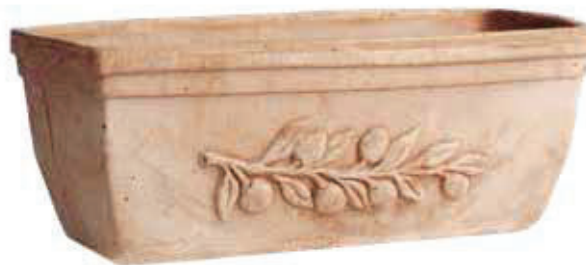
INFO PAG: 146