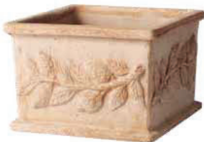
INFO PAG: 147