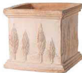
INFO PAG: 145