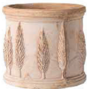
INFO PAG: 145