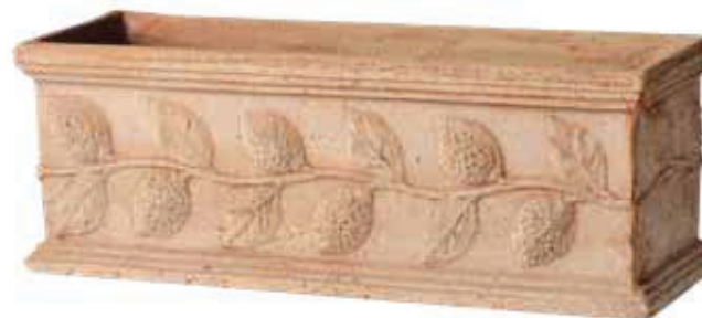
INFO PAG: 147