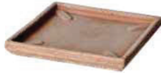
INFO PAG: 149