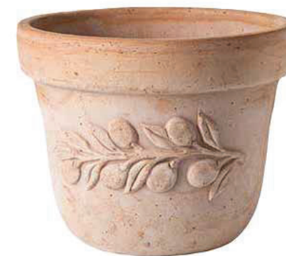
INFO PAG: 146