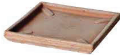
INFO PAG: 147