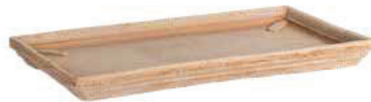
INFO PAG: 147