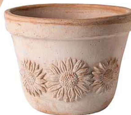
INFO PAG: 146