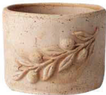
INFO PAG: 146