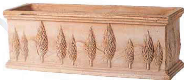
INFO PAG: 145